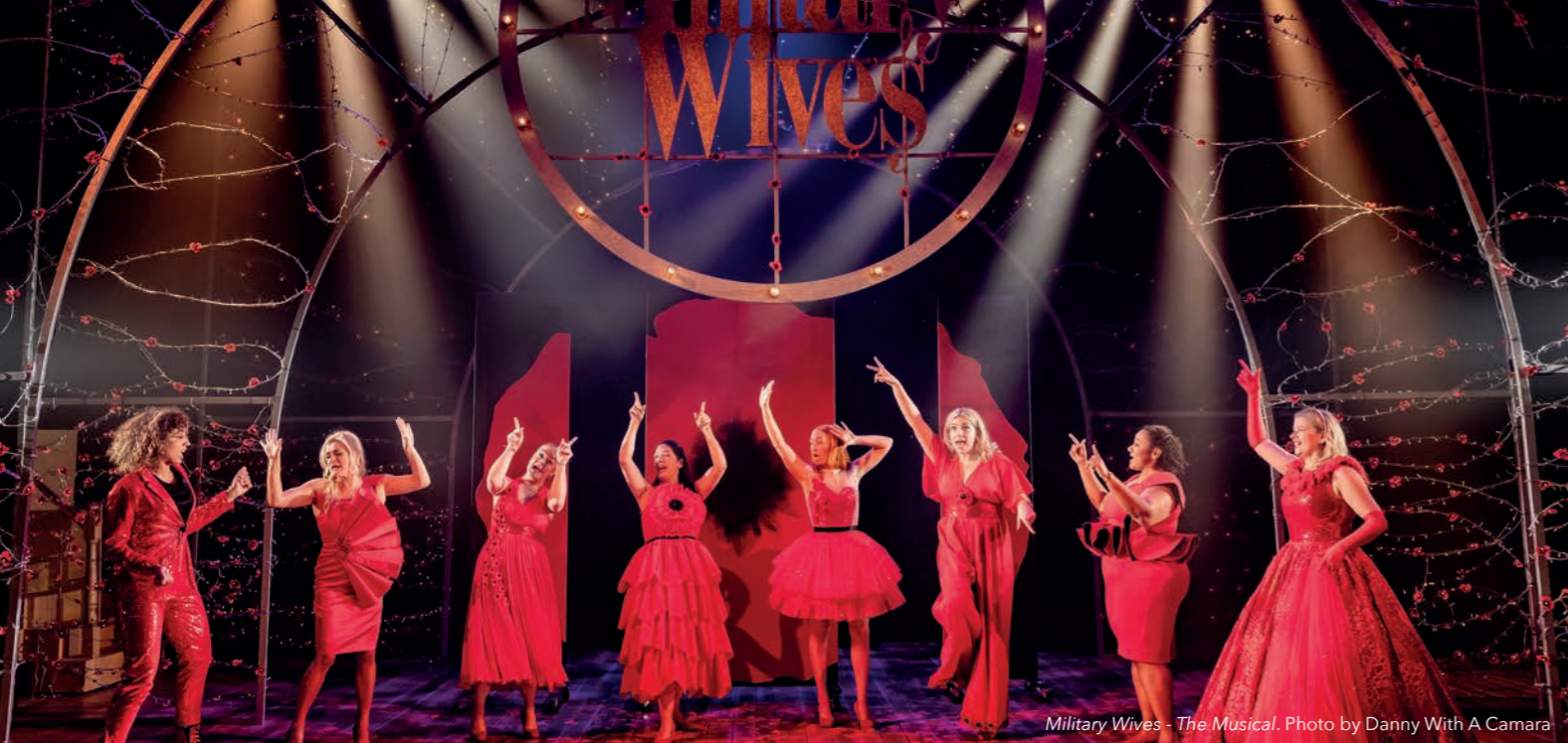
Military Wives - The Musical.

The position is not remunerated but we can cover expenses and you'll also get two free tickets to all productions we create ourselves. If you think you fit the bill, please send a CV and introductory letter, short video, voice note or PowerPoint presentation (no more than 5 slides please) to