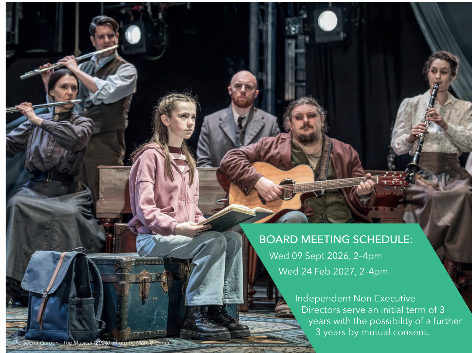
The Secret Garden - The Musical (2026).